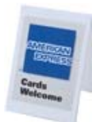
Cards Welcome Tent Stand 10.3cm x 7.8cm