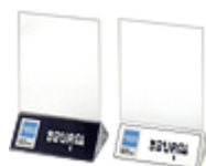
Menu Stand/Holder 18.5cm x 12cm x 7cm