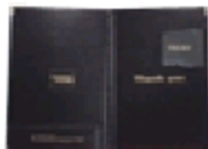
Billfolder 26.8cm x 14.4cm